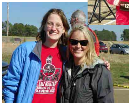
Runners and volunteers enjoy Run for Hope!