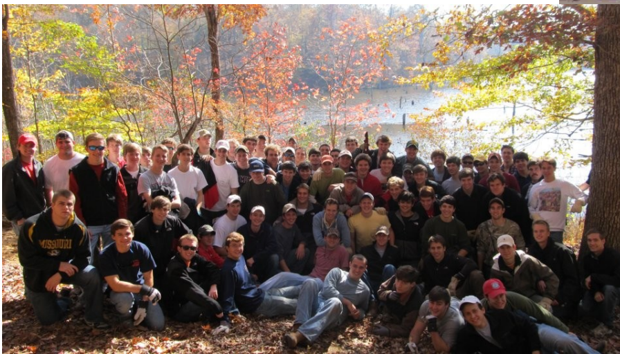
Members and pledges of the Ole Miss chapter of Alpha Tau Omega spent a November Saturday clearing undergrowth in several acres of Hopewell woods.